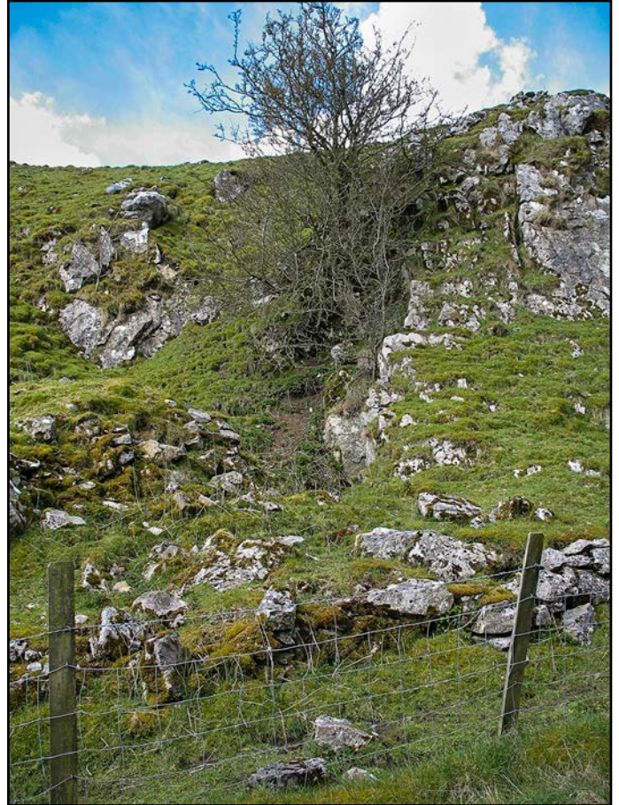
The location of Dowel Dale Side Pot.

Meet at: British Caving Library, The Studio, Glutton Bridge, SK17 0EN.