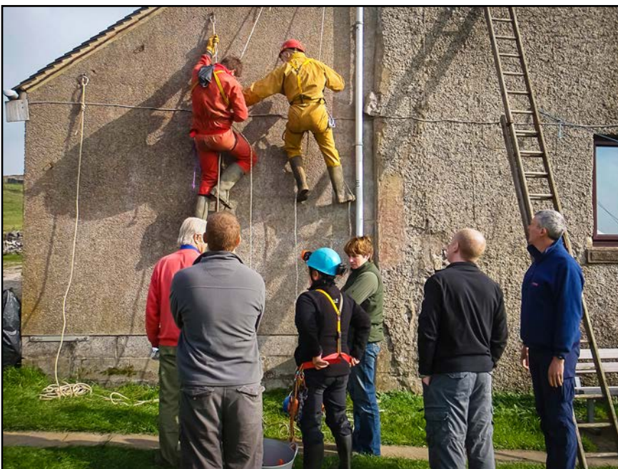
SRT training on the Orpheus Caving Club practice wall.

The afternoon session may also look at problem-solving, self-rescue and basic rigging. People who join us for these events usually have their own equipment, and it would be good to bring what you use to get top tips etc. Nige will also have plenty of kit on the day to try.