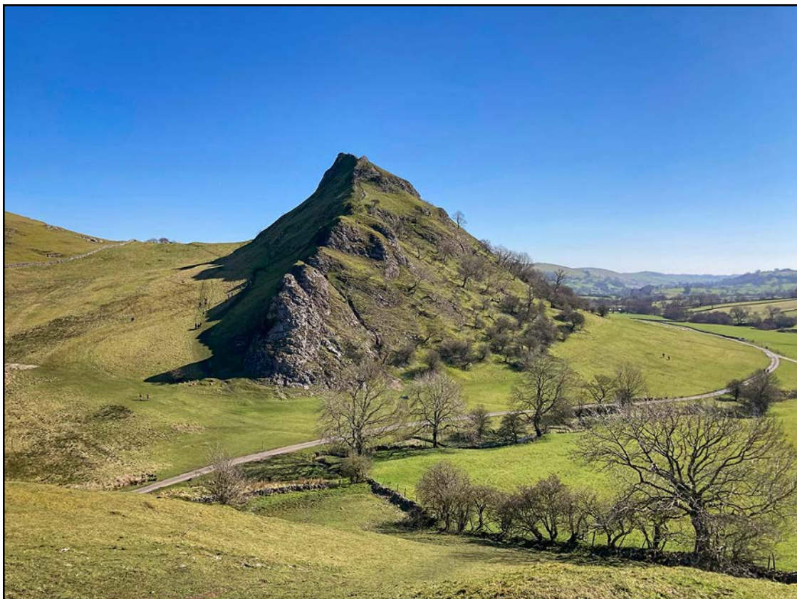
Parkhouse Hill, looking from the slopes of Chrome Hill, just to the northwest.